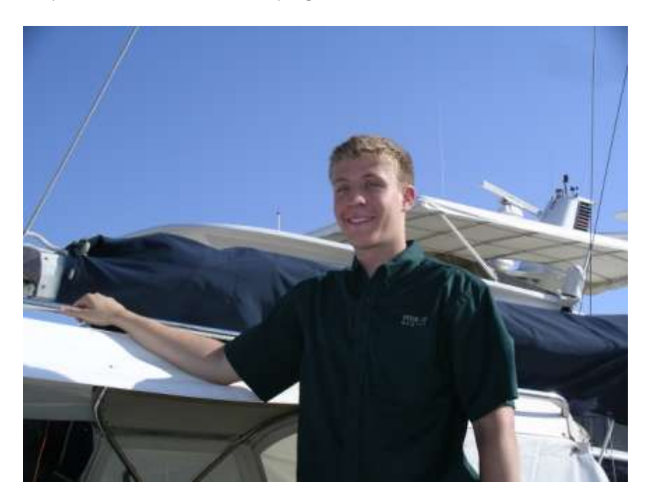
In San Diego on "Just Passing Through", June 2009

This is an interesting website about Matson & the M/V Maunawili -http://www.matson.com/bos/progressMain.shtml