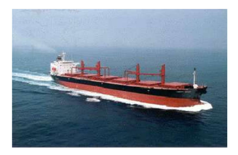
The Liberty Eagle

These websites have some information on the Liberty Eagle: <u>www.libertymar.com</u> <u>www.libertygl.com</u>